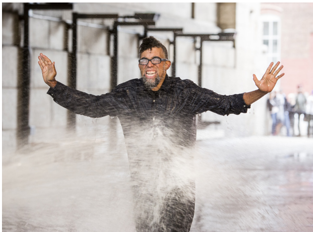
Photo: Dread Scott (American, born 1965). On the Impossibility of Freedom in a Country Founded on Slavery and Genocide , performance still, 2014. Pigment print, 22 x 30 in. (55.9 x 76.2 cm). Project produced by More Art. Collection of the artist, Brooklyn. © Dread Scott.

At key moments in history, artists have reached beyond galleries and museums, using their work as a call to action to create political and social change. Opening December 11, 2015, the Brooklyn Museum's exhibition Agitprop! explores the legacy and continued power of politically engaged art through more than fifty contemporary projects and artworks from five historical moments of political urgency. Agitprop! will be on view from December 11, 2015, through August 7, 2016, in the Elizabeth A. Sackler Center for Feminist Art at the Brooklyn Museum.