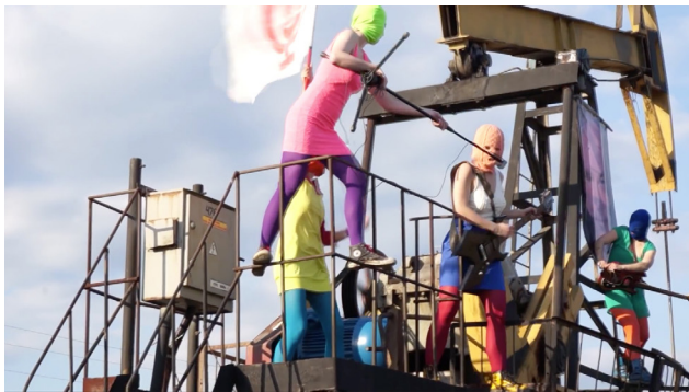
Pussy Riot (Russian, founded 2011). Like a Red Prison , 2013. Video still from Like a Red Prison , 3 minutes, 43 seconds. © Pussy Riot. Courtesy of the artists

The fully realized Agitprop! exhibition opens on April 6 with the addition of fifteen contemporary artists and collectives, nominated by the exhibition's second round of participants. Presented by the Brooklyn Museum's Elizabeth A. Sackler Center for Feminist Art, the third and final installation of Agitprop! solidifies the exhibition's mission to explore the legacy and continued power of politically engaged art. The show will be on view through August 7 with a dynamic and thought-provoking installation featuring a full range of material, including photography and film, prints and banners, street actions and songs, and TV shows, social media, and performances.