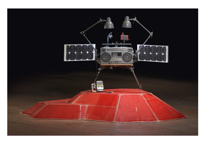
Tom Sachs (American, born 1966). Phonkey, 2011. Mixed media, 49 \times 34 \times 13^3/^4 in. (124.5 x 86.4 x 34.9 cm). Courtesy of the artist. (Photo: Genevieve Hanson)

The Brooklyn Museum is pleased to announce Tom Sachs: Boombox Retrospective, 1999–2016 has been added to the spring 2016 exhibition schedule. Paying tribute to a defining symbol of street music culture, Tom Sachs will transform the Brooklyn Museum's Martha A. and Robert S. Rubin Pavilion into a living sound system through an installation of eighteen sculptural boom boxes. Hovering somewhere between art and science, functional and mythological, Tom Sachs: Boombox Retrospective, 1999–2016 will go live on April 21 and run through August 14, 2016. Other spring exhibitions include Agitprop!, Disguise: Masks and Global African Art , and This Place .