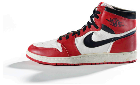
Nike. Air Jordan I, 1985. Nike Archives.